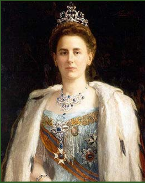
Queen Wilhelmina of the Netherlands

Wilhelmina: (Wilhelmina Helena Pauline Maria; August 31, 1880 - November 28, 1962) was queen regnant of the Kingdom of the Netherlands from 1890 to 1948. She ruled the Netherlands for fifty-eight years, longer than any other Dutch monarch. Her reign saw World War I and World War II, the Great Crisis of 1933, and the decline of the Netherlands as a major colonial empire. Outside the Netherlands she is primarily remembered for her role in the Second World War, in which she proved to be a great inspiration to the Dutch resistance, as well as a prominent leader of the Dutch government in exile.